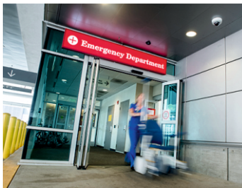
Hospital Emergency wards