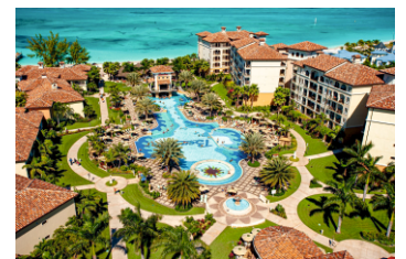
Hotels & Resorts