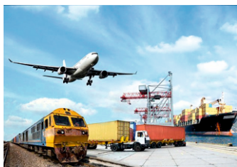
Ports of Entry/Exit